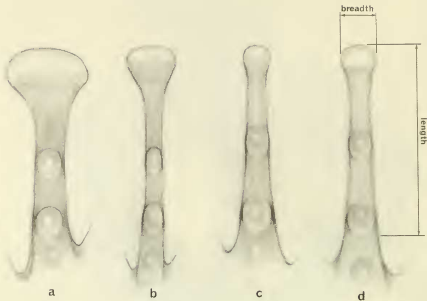
FIGURE 4. Inferior view of third finger of four species of Philippine Platymantis illustrating comparative dilation of disks and adjacent phalanges: a. P. hazelae , b. P. insulatus , c. P. dorsalis , d. P. levigatus . Method of measurement of breadth of disk and length of finger is shown.